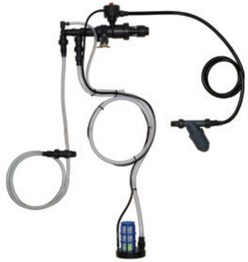
Gravity feed type injector (4-02)